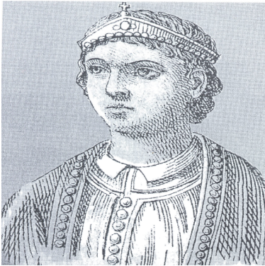
IOANNIS D. LASKARIS (1258-1261)

Theodore II Laskaris was succeeded in his throne, by his only son Ioannis IV Laskaris who was only 8 years old. Due to the fact that he was not of age, his father appointed two vice regents – guardians the first vestiary Georgio Muzalona and the Patriarch Arsenio.