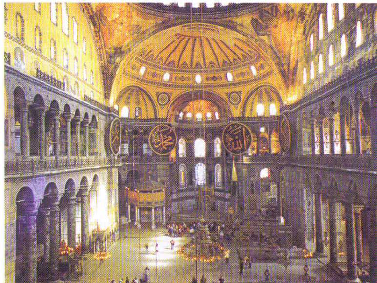
General internal view of Saint Sophia Church