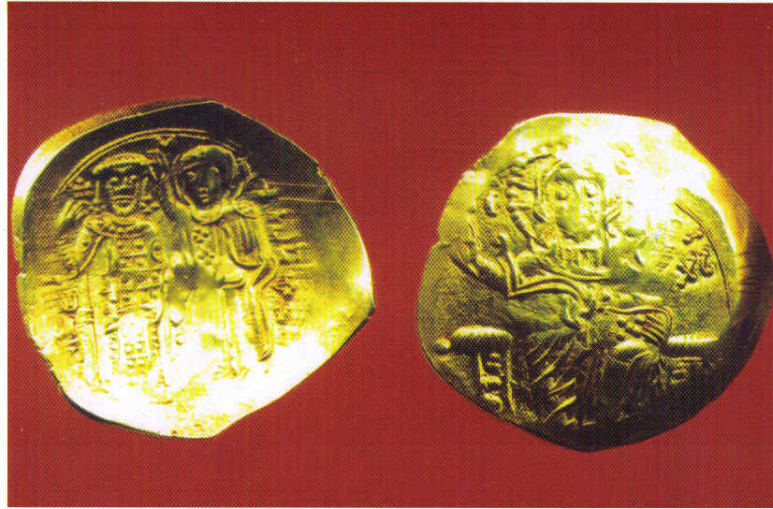
Coins of 1222-1254 era of Byzantine Emperor Ioannis Vatazis which show at the first option Ioannis to στεφεται by God Mother and from the other Christ