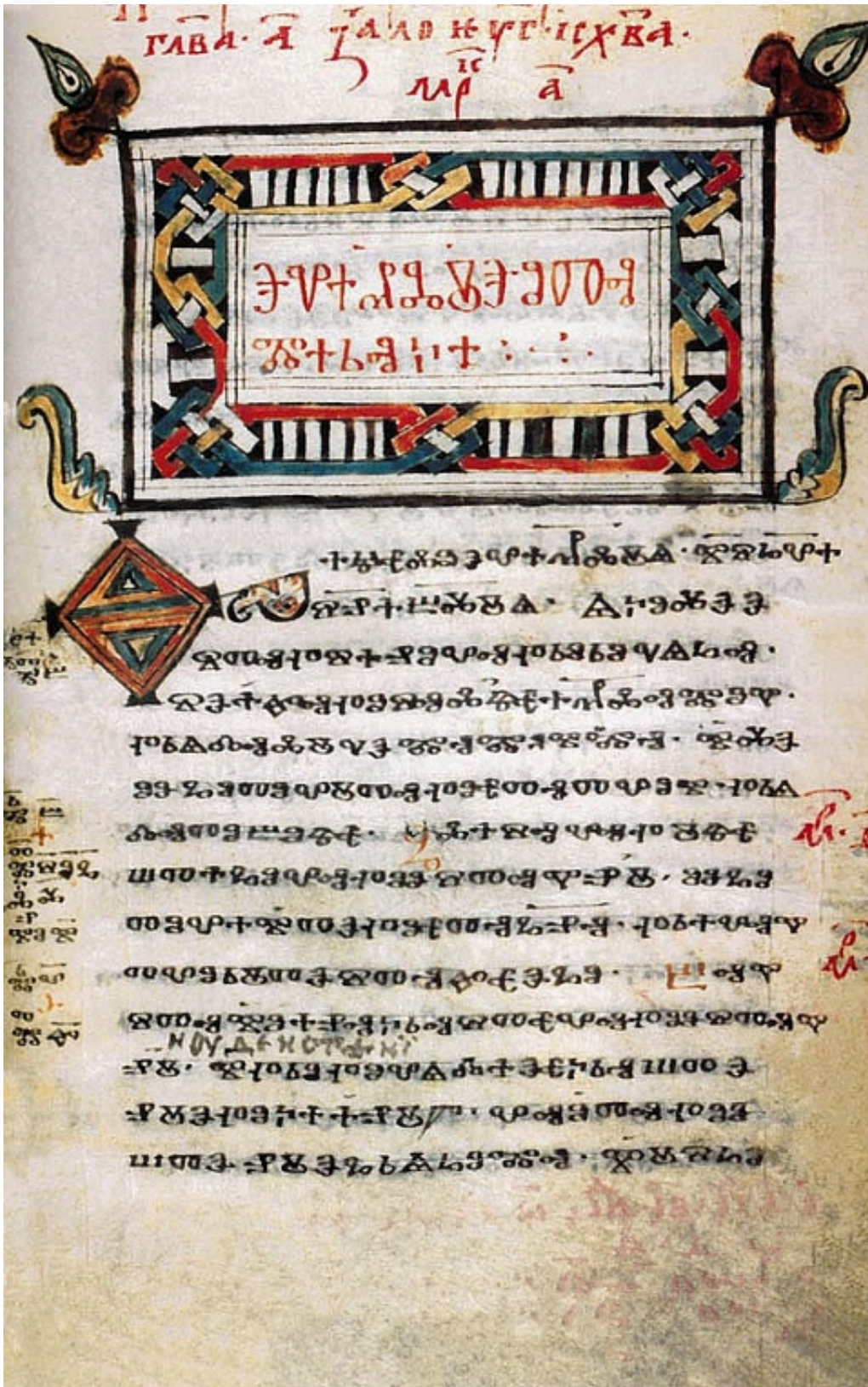
Page of Codex Zographensis nowadays kept in Bulgarian Zograf Monastery St. gt. martyr George