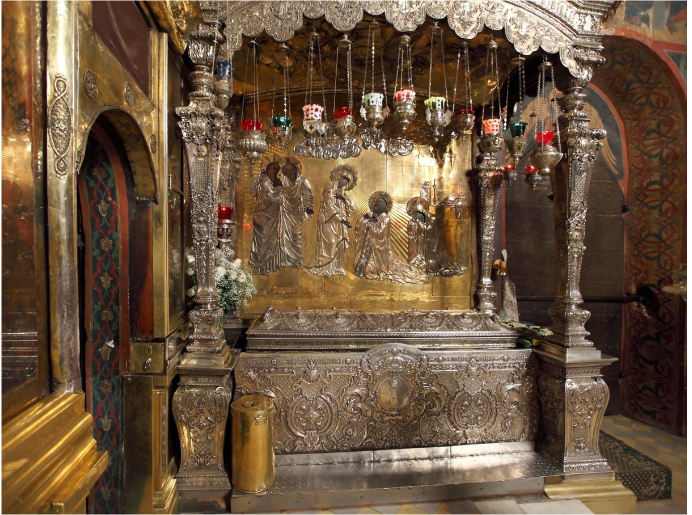
Reliquary with the incorruptable Holy Relics of Saint Sergij of Radonezh, kept in the Saint-Sergieva-Lavra monastery