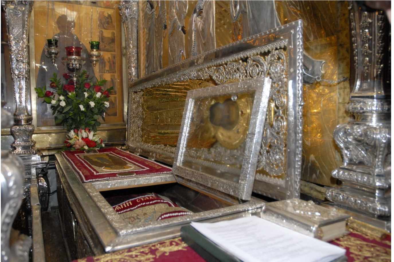
Opened reliquarium coffin with the incorruptible relics of saint Serigius of Radonezh (the feasts are opened for veneration by pilgrims 4 times a year during the saint feast veneration)