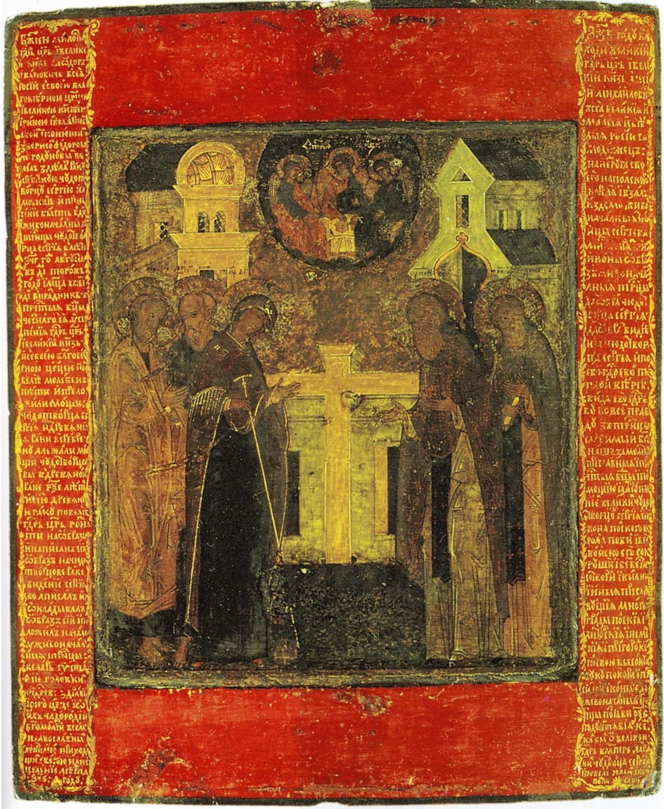
The Apparition of the Mother of God to St. Sergius 16th century icon