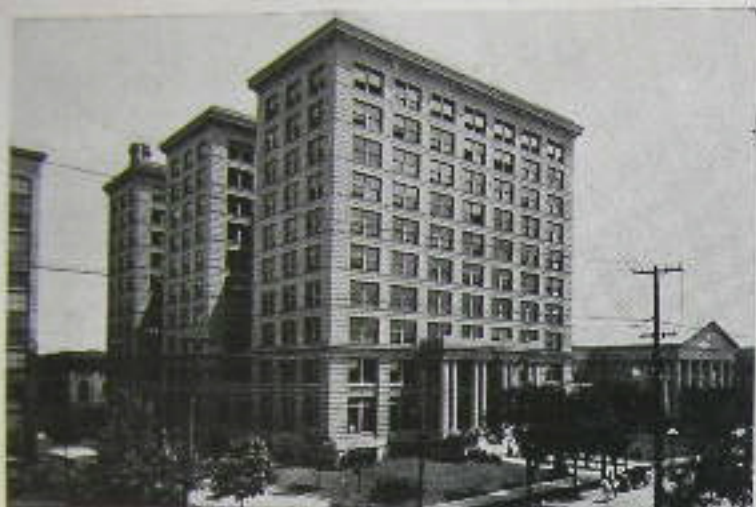
The Office Building and Schoolhouse at the factory