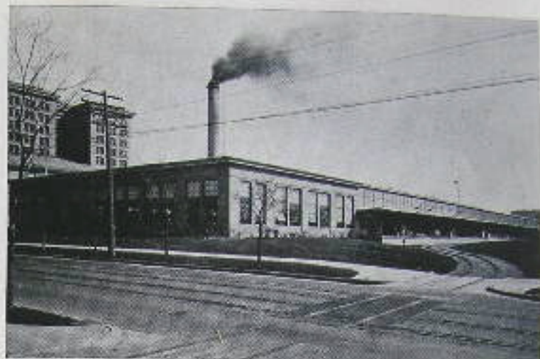
The Printing Division where N. C. R. supplies are printed