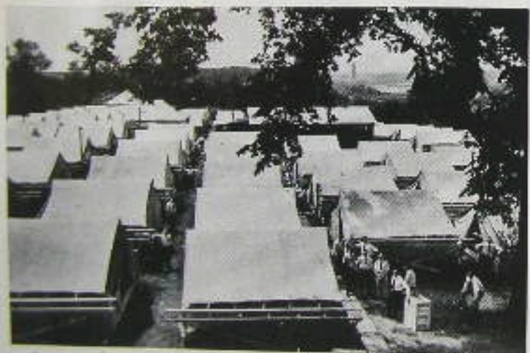
A city of tents with every modern convenience