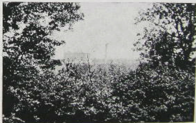
Looking north to the factory from Sugar Camp