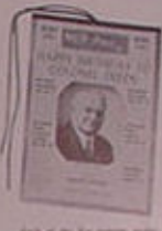
Clipping of the [Name] newspaper, which was published in the [Name] of the [Name] Club.

When [Name], the [Name] of the [Name] Club, presented the [Name] award to [Name] at the Waldorf-Astoria dinner. The award is given to the [Name] of the [Name] Club.