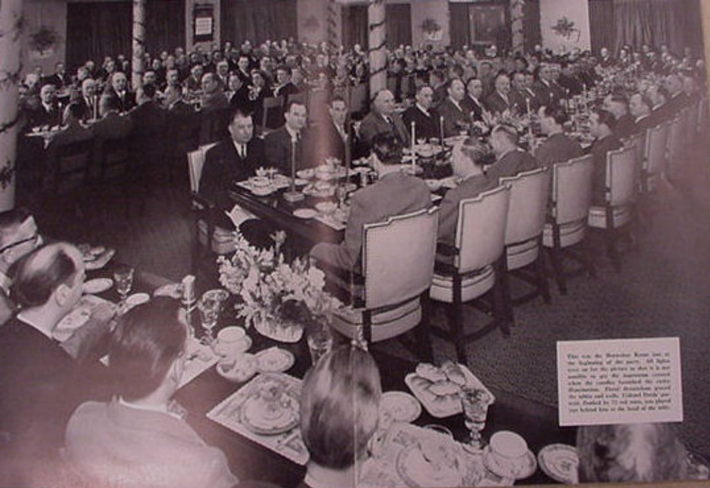
This was the Waldorf-Astoria dinner last in the highlights of the party. 200 guests were set for the picture in what is not possible in any other restaurant, except when the candles flashed the extra illumination. Floral decorations around the tables and walls. Colored lights were used to light the room, and there was a lot of light from the head of the table.