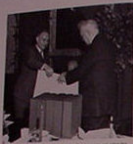
Mr. [Name] presents the [Name] award to [Name] at the Waldorf-Astoria dinner.