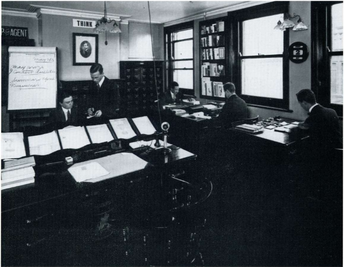
Sales office in London, England, showing early "Think" sign.