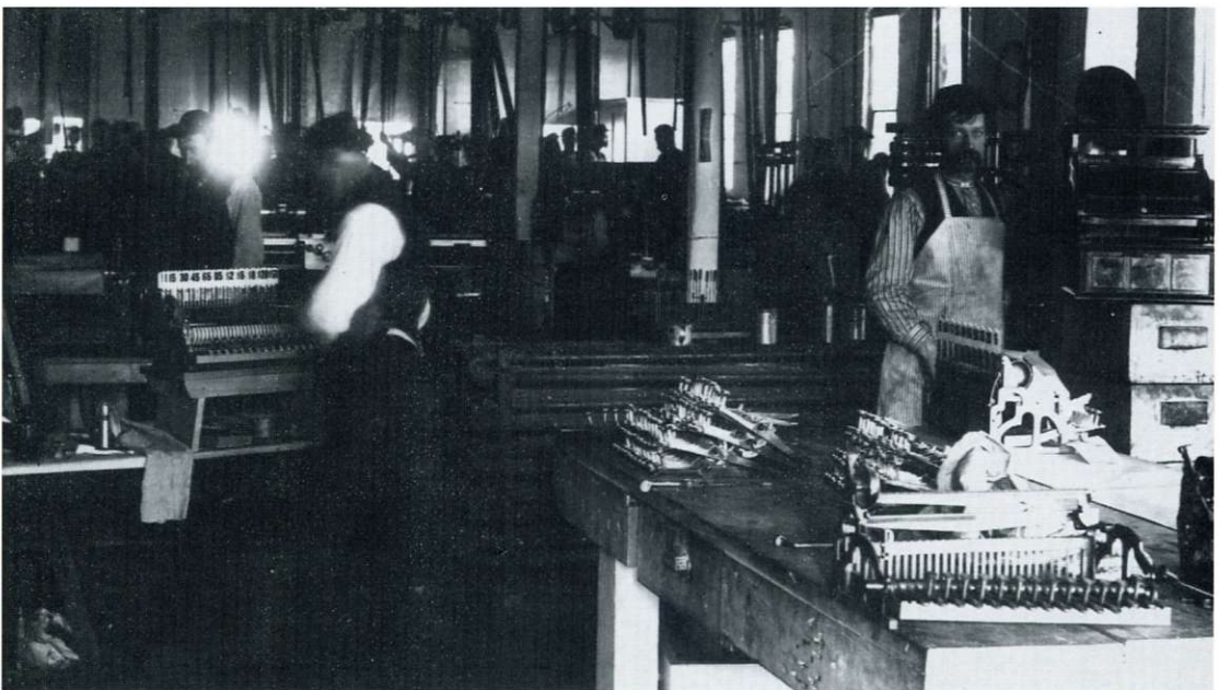
Factory scene showing assembly of detail adder register.