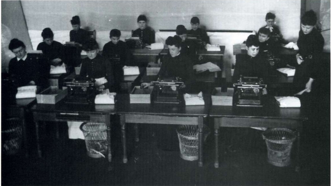
Typist pool addressed labels for direct mail advertising.