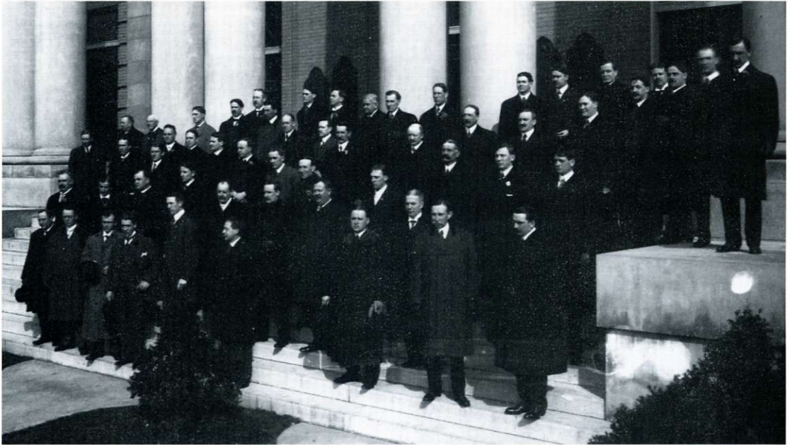
Attendees of first Century Point Club (CPC) convention.