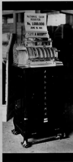
One-millionth cash register.