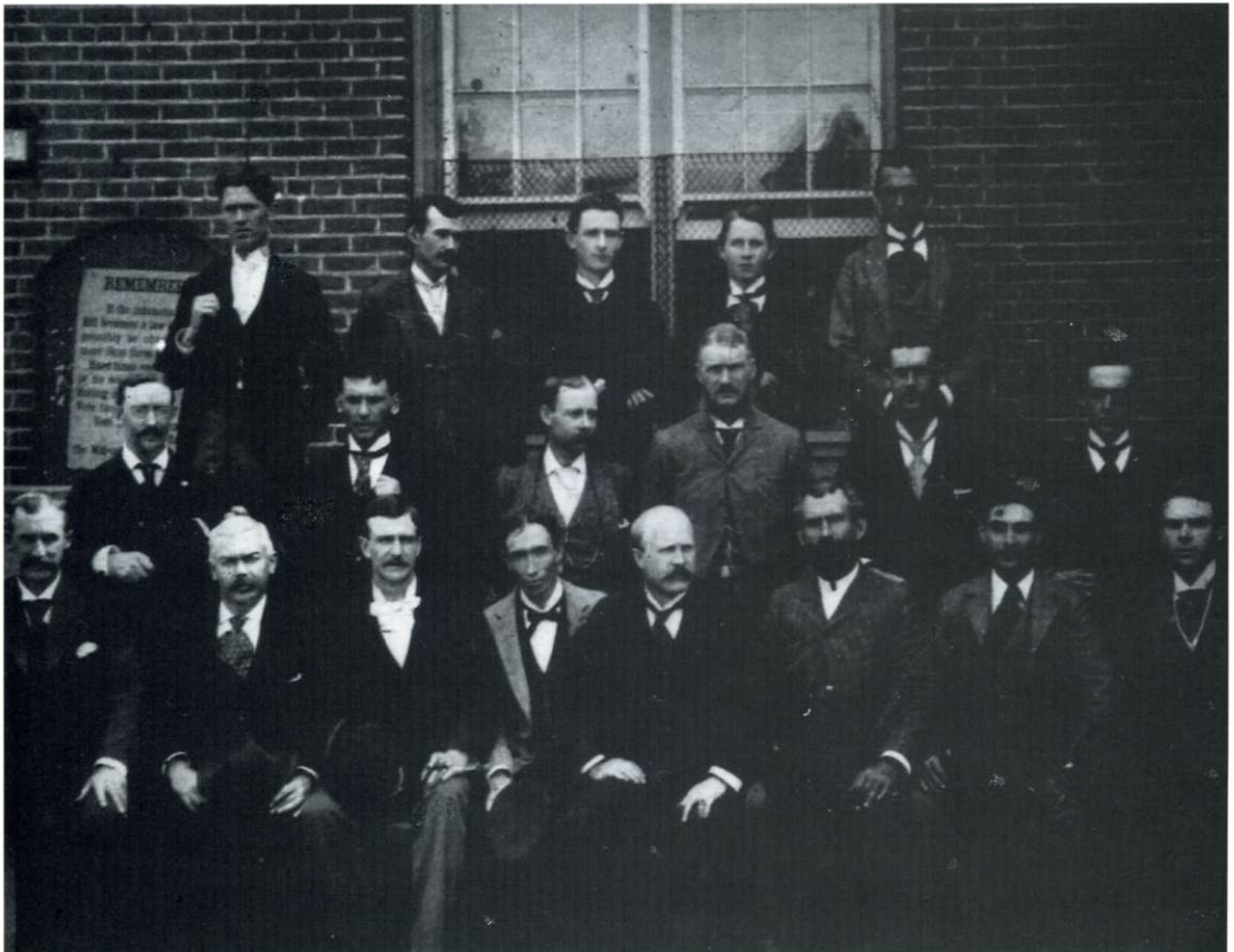
First sales training class, held in 1894.