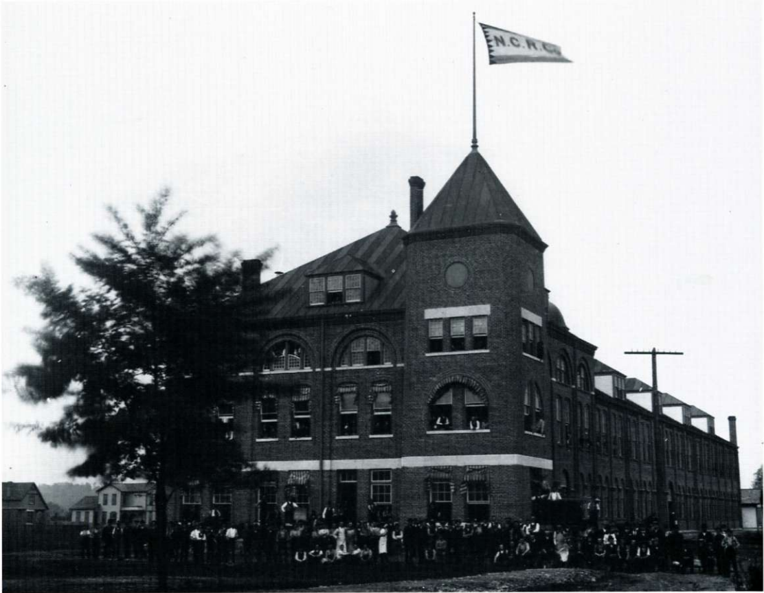
First building of new factory complex, constructed on Patterson farm during 1888.