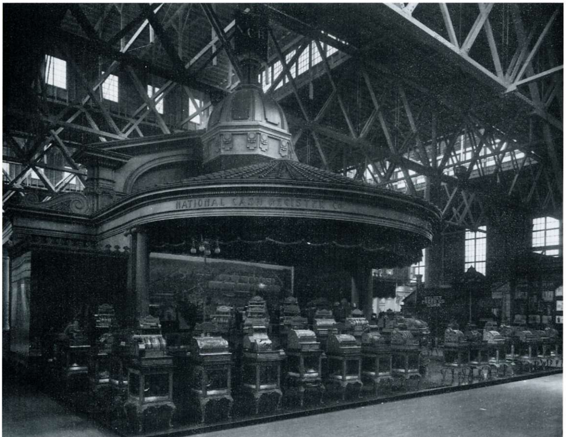
Exhibit at 1904 St. Louis World's Fair.