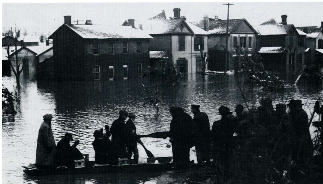
Rescue operations during 1913 flood used NCR-built boats.