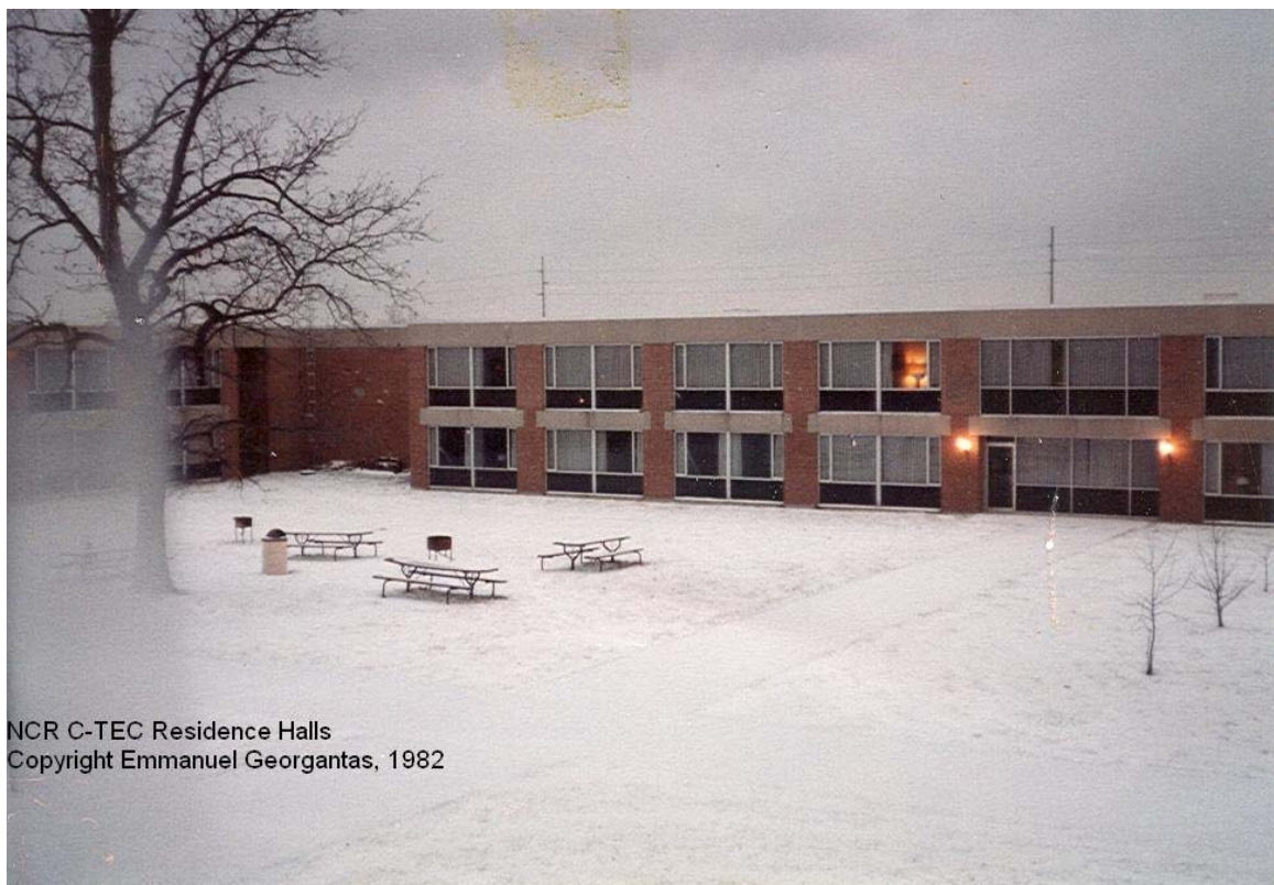
NCR C-TEC Residence Halls Copyright Emmanuel Georgantas, 1982

The whole complex included numerous classrooms and many spacious system rooms where all the new computer products were installed to serve the training needs of those attending classes at the C-TEC. On the ground floor was what we used to call the “Fish Bowl”, a very large space surrounded by transparent glass walls and populated with computer systems and peripherals.