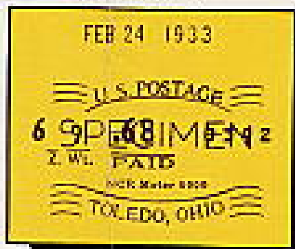
Parcel Post Labels

Provides a quick and accurate method of making report to post office as to amount of postage and number of pieces in each day's mailing.