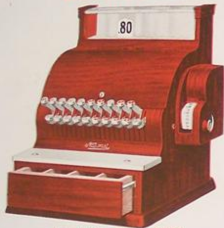
No. 726—Price $150

Metal cabinet finished in brown mahogany, oak or mahogany.