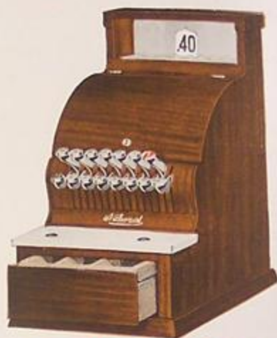
No. 711—Price $75.00

Metal cabinet finished in brown mahogany, oak or mahogany.