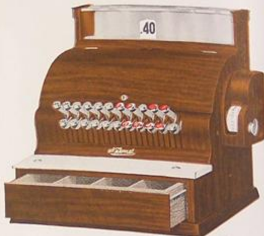
No. 728-T—Price $200

Metal cabinet finished in brown mahogany, oak or mahogany.