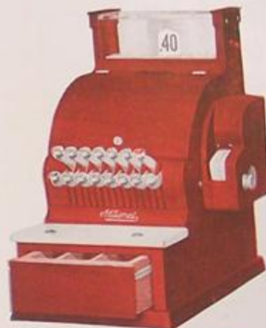
No. 717—Price $125

Metal cabinet finished in brown mahogany, oak or mahogany.